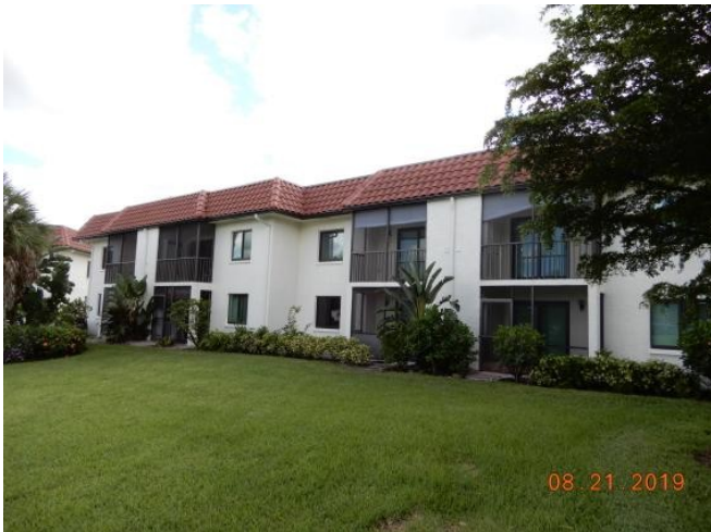
#3 West View