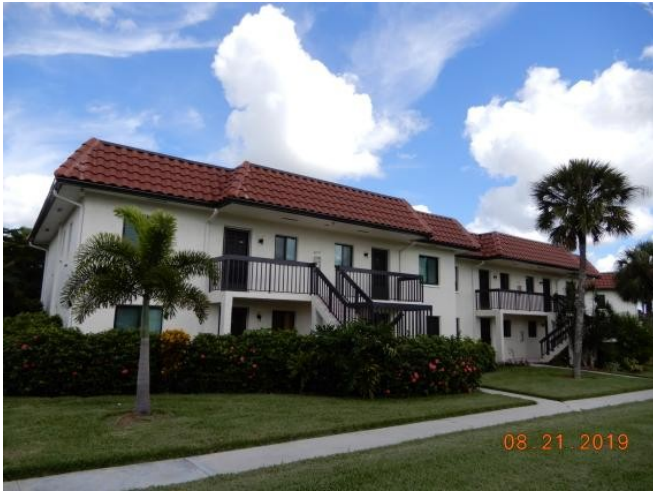
#1 East View