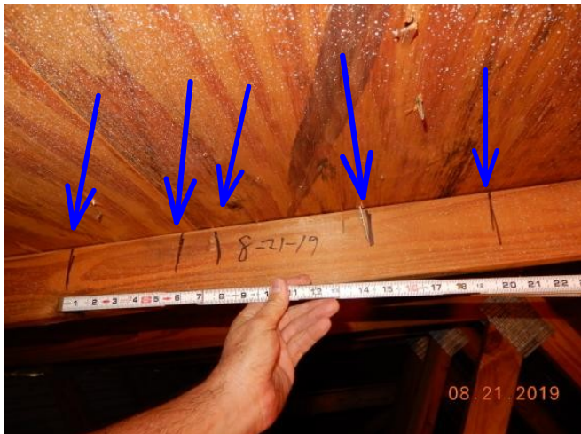
#21 8 D Nails Spaced 6" OC