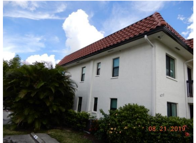
#2 South View