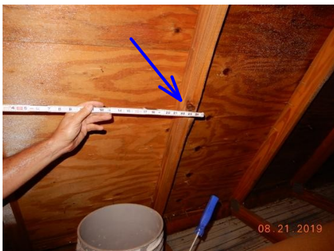
#17 Trusses Spaced 24" OC