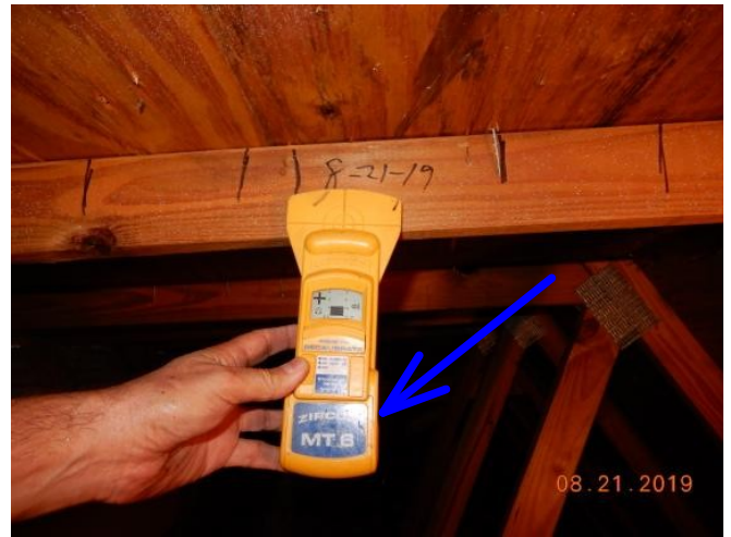
#20 Zircon Locating Tool