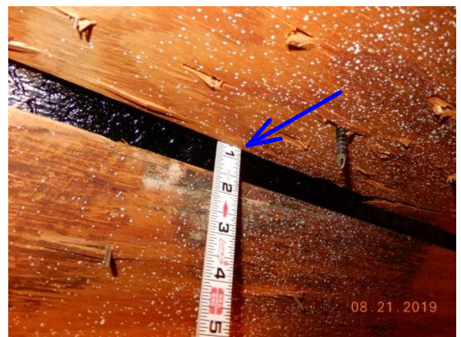
#18 Plywood 3/4" Thick