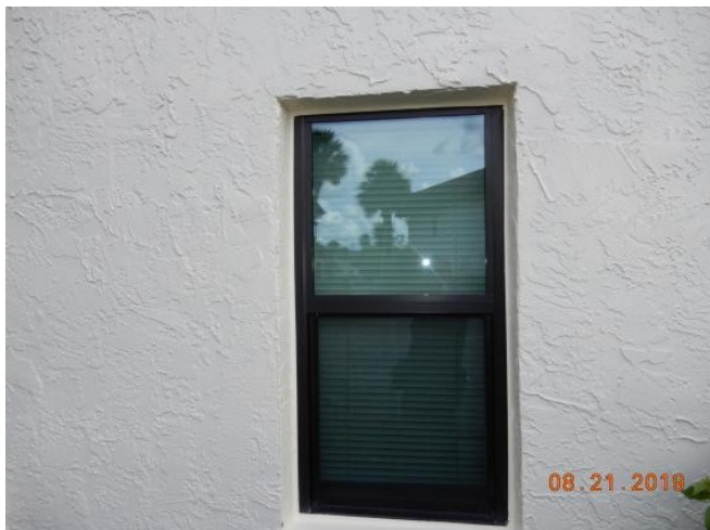
#11 Window Example #2 Impact