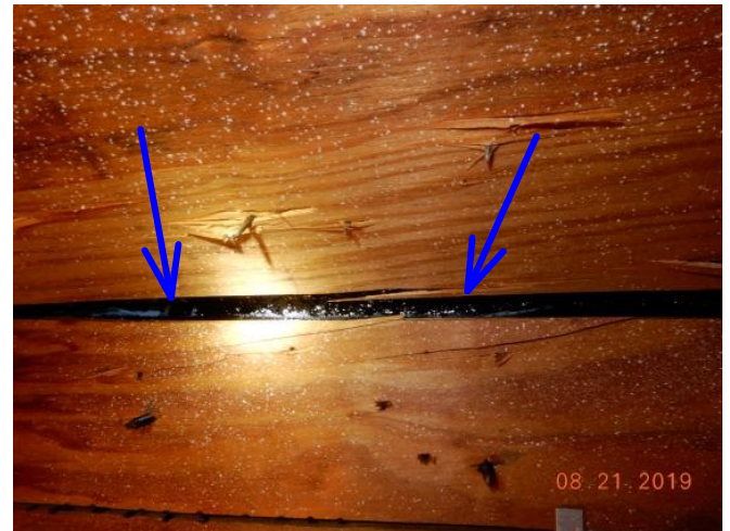
#16 SWR See Permit