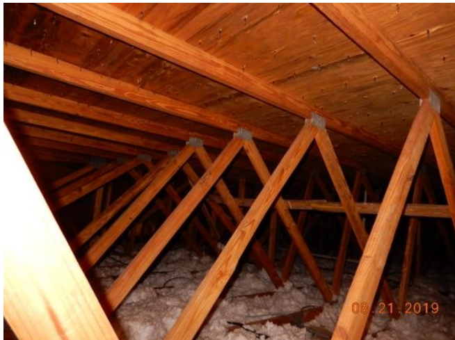
#15 2x4 Trusses