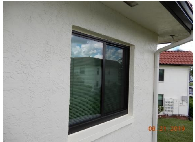
#10 Window Example #1 Impact