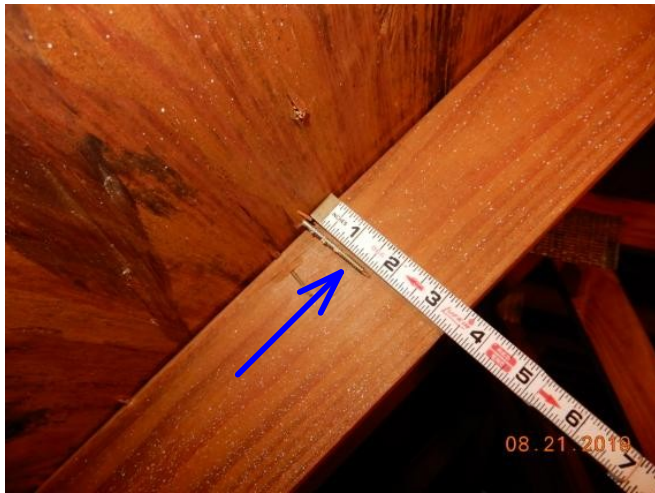
#19 8 D Nails