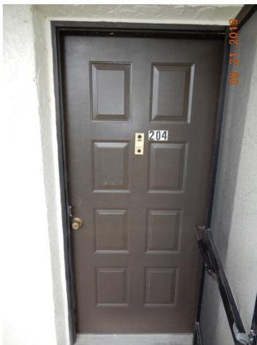
#5 Front Entry Door Example