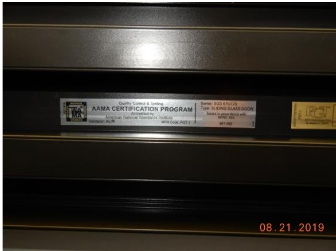
#9 Rear Entry Door Wind label #2