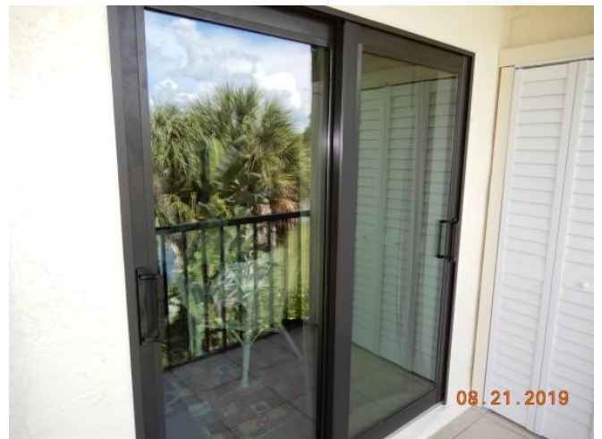
#6 Rear Entry Door Impact