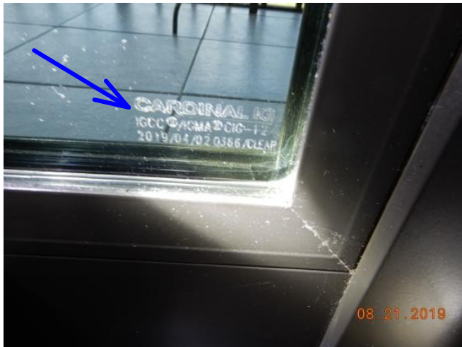
#7 Rear Entry Door Glass Etch