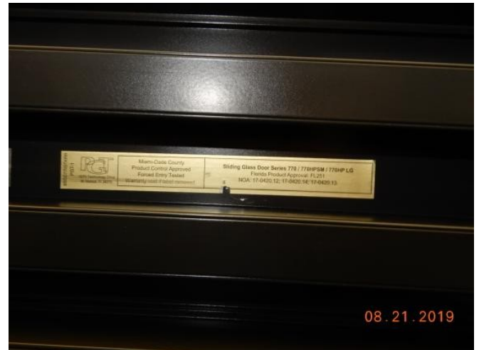
#8 Rear Entry Door Wind label #1