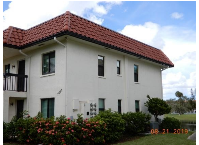
#4 North View