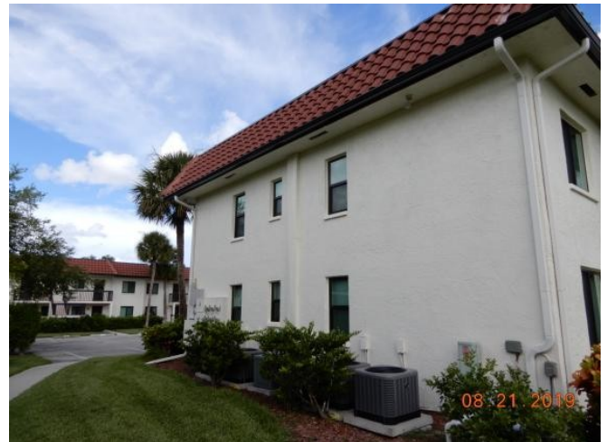
#4 South View