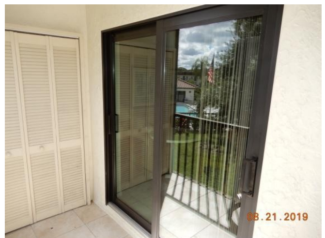
#6 Rear Entry Door Impact