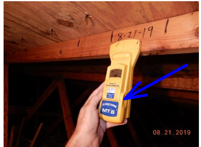
#20 Zircon Locating Tool