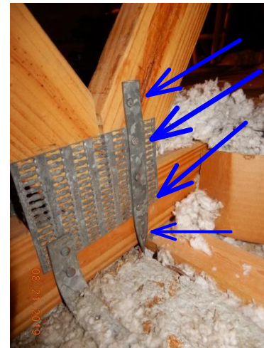
#22 Clip with Multiple Nails