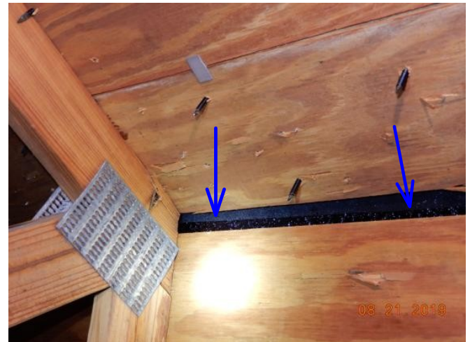
#16 SWR See Permit </