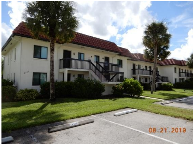
#1 West View