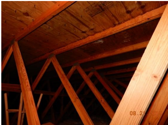
#15 2x4 Trusses