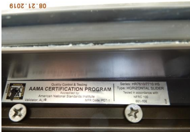
#13 Window Wind Label #1