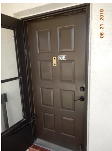
#5 Front Entry Door Example