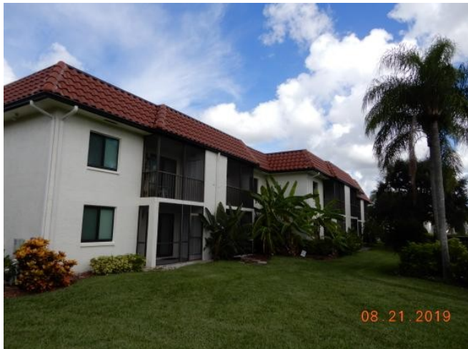
#3 East View