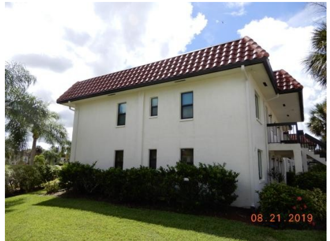
#2 North View