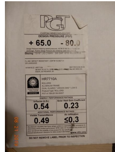
#14 Window Wind Label #2