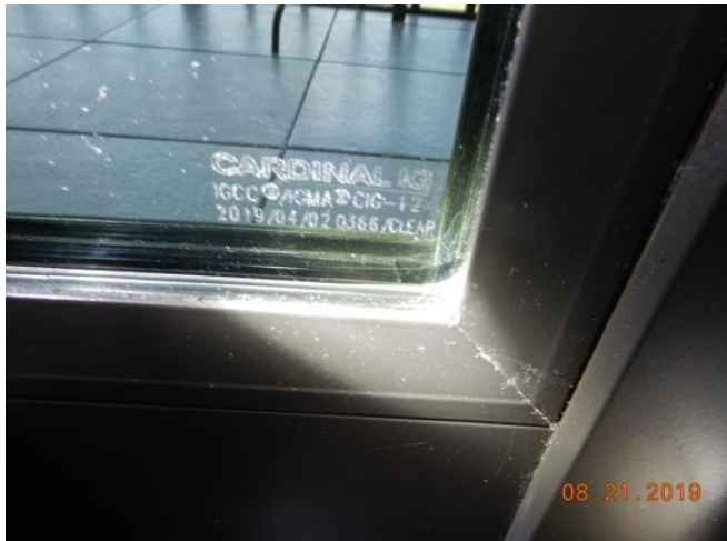
#9 Rear Entry Door Glass Etch