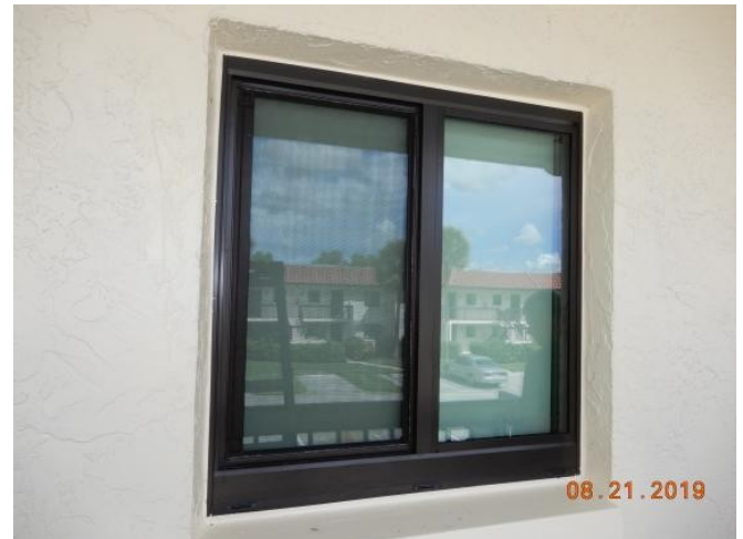
#10 Window Example #1 Impact