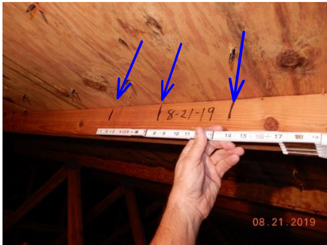
#21 8 D Nails Spaced 6" OC