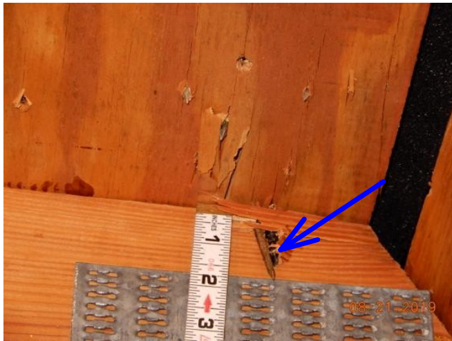
#19 8 D Nails