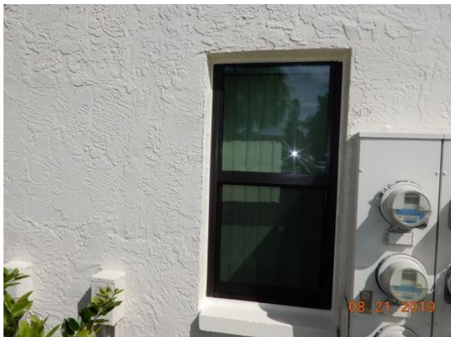
#11 Window Example #2