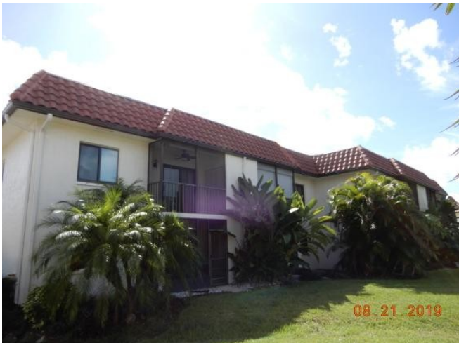
#3 West View