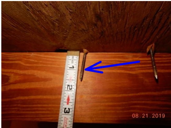
#19 8 D Nails (3/4" Plywood)