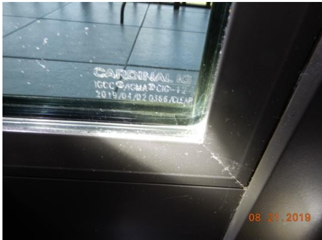
#9 Rear Entry Door Glass Etch