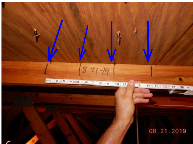
#21 8 D Nails Spaced 6 OC