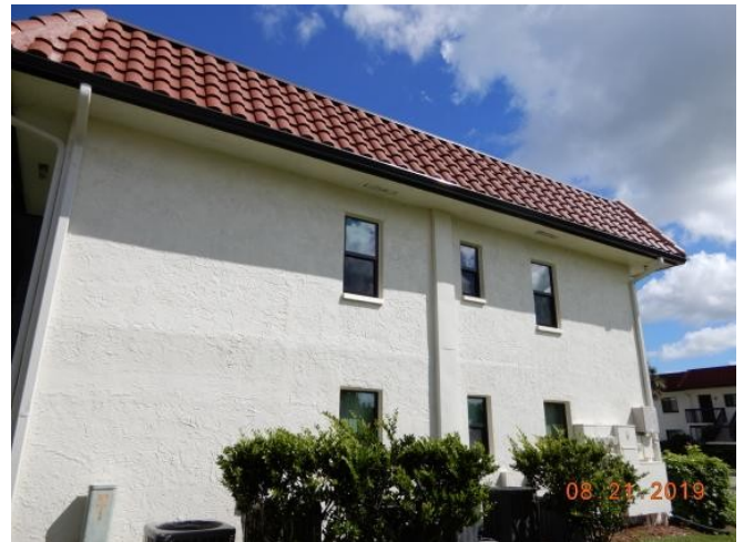
#4 South View