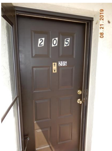
#5 Front Entry Door Example