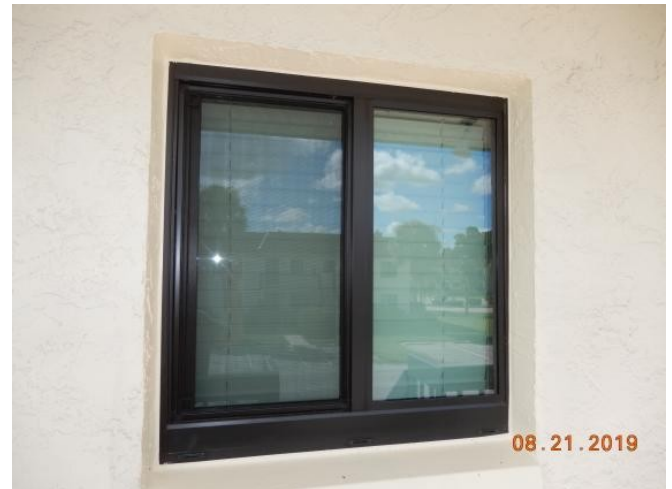
#10 Window Example #1 Impact