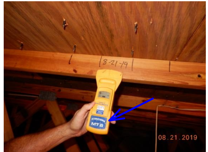
#20 Zircon Locating Tool