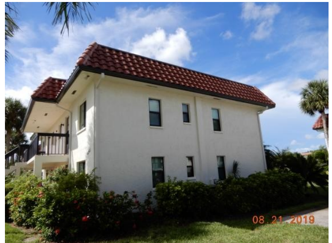
#2 North View