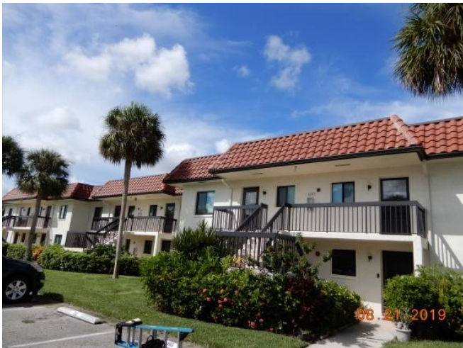
#1 East View