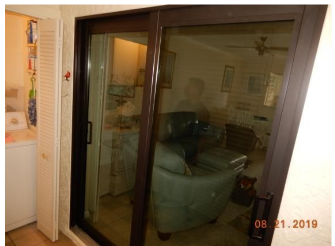
#6 Rear Entry Door Impact