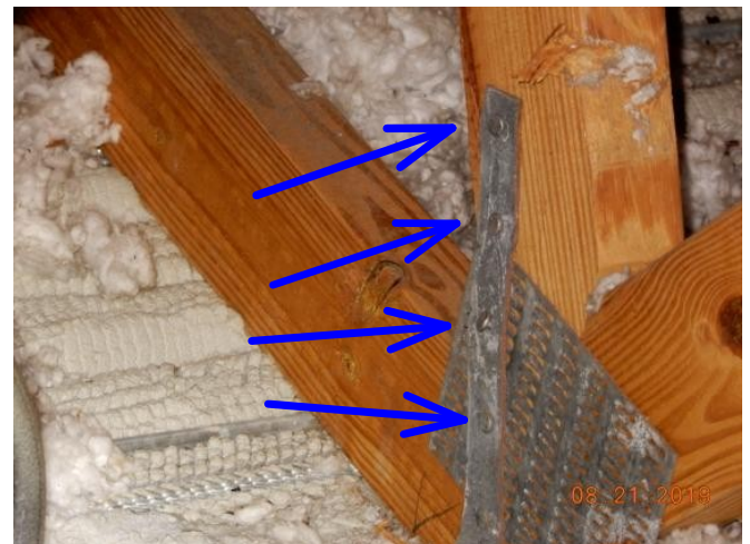
#22 Clips with 4 Nails