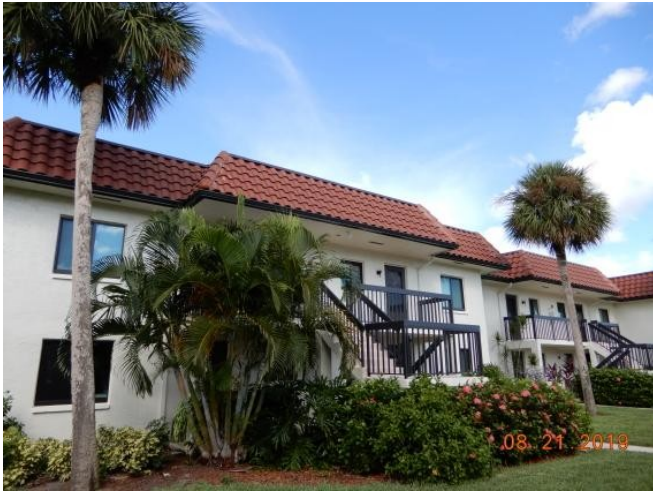
#1 East View