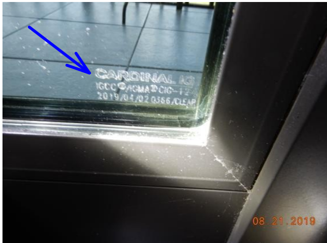
#9 Rear Entry Door Glass Etch