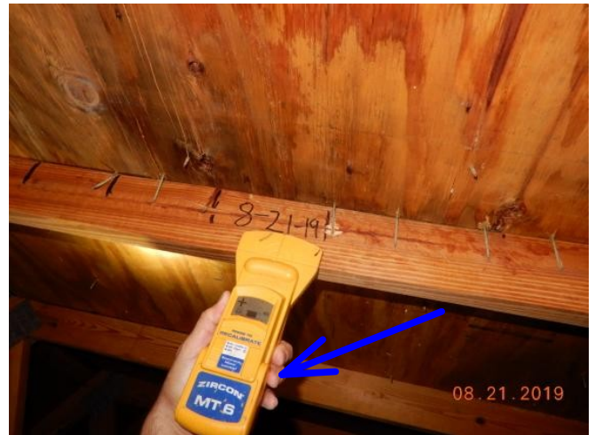
#20 Zircon locating Tool