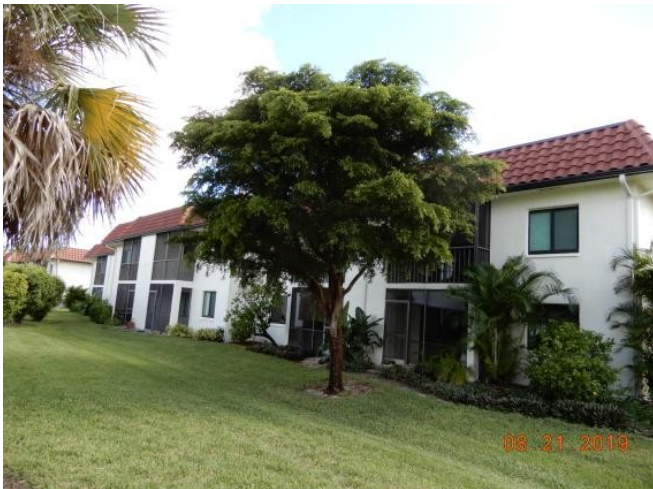
#3 West View