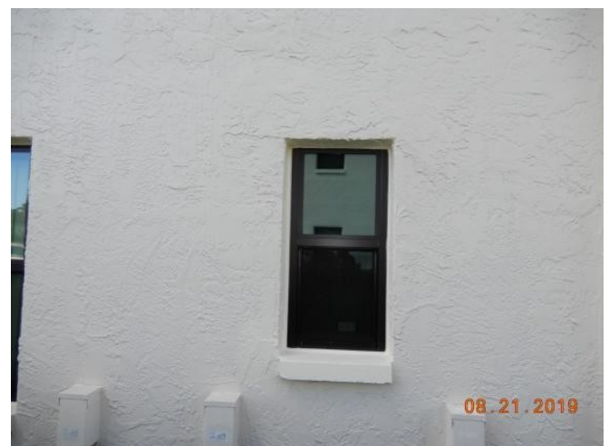
#12 Window Example #3 Impact