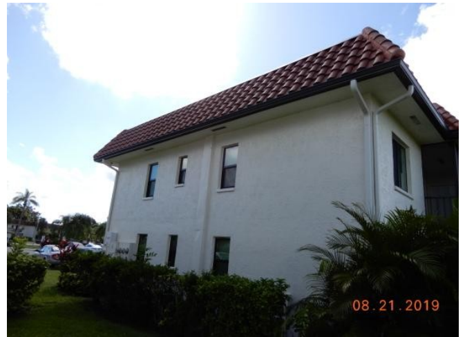
#4 North View