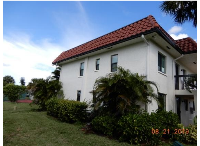
#2 South View