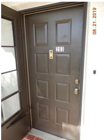
#5 Front Entry Door Example