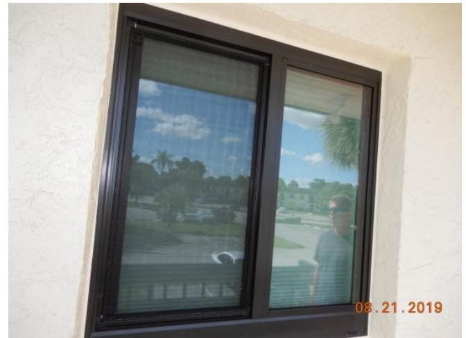
#10 Window Example #1 Impact