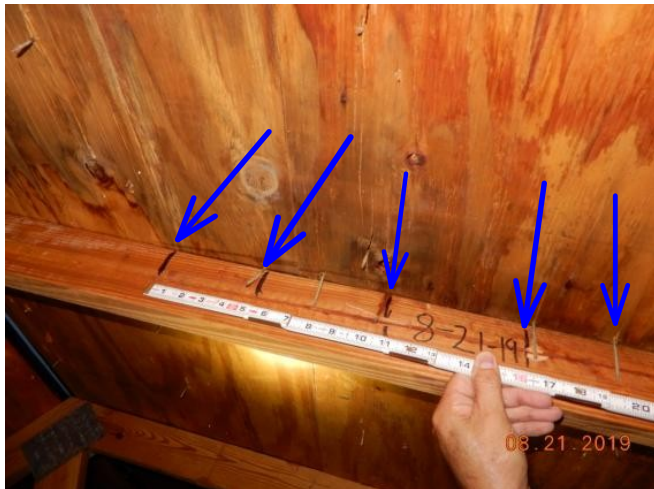
#21 8 D Nails Spaced 6" OC