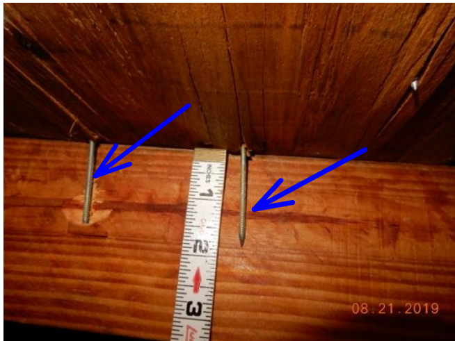
#19 8 D Nails