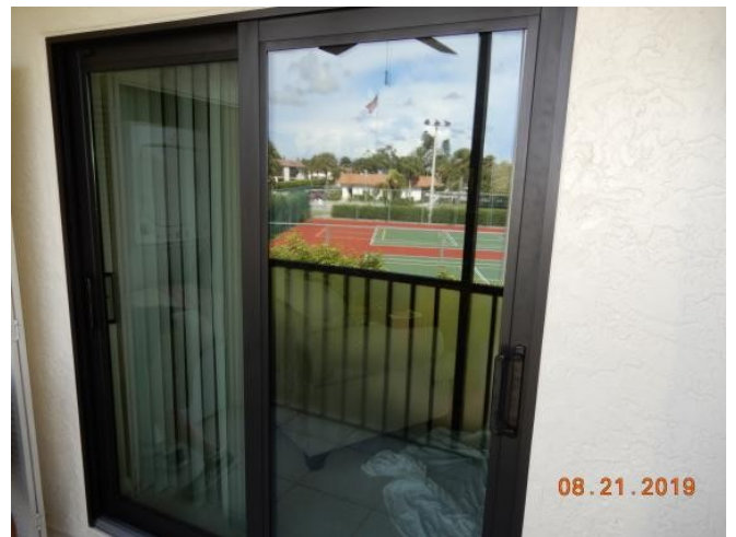
#6 Rear Entry Door Impact